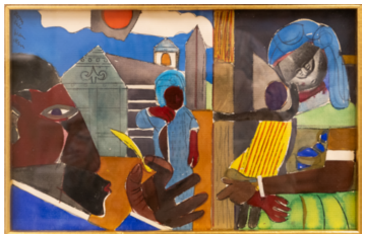
Romare Bearden, Study for La Primavera, n/d collage and watercolor on board