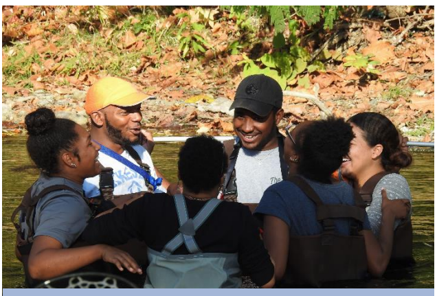
Organismal/ Environmental Research