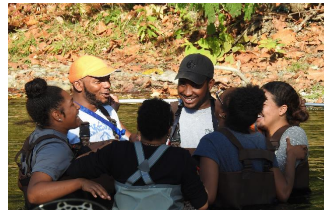
Organismal/ Environmental Research