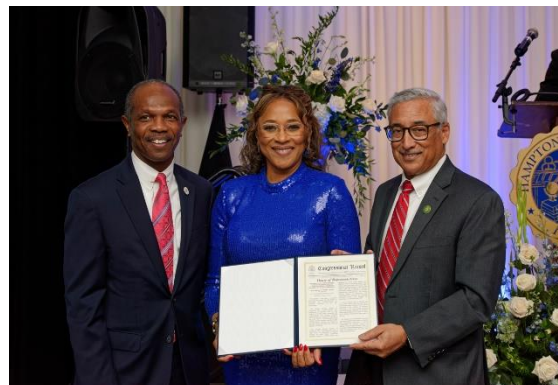
Hampton Mayor Donnie Tuck and Representative Bobby Scott (VA-3)