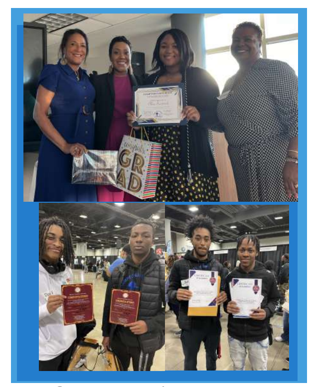
Turning Dreams Into Realities!!

Contact Us: HAMPTON UNIVERSITY UPWARD BOUND 97 Marshall Avenue 2nd Floor, Academy Building Hampton, VA 23668 (757) 727-5307 (0)