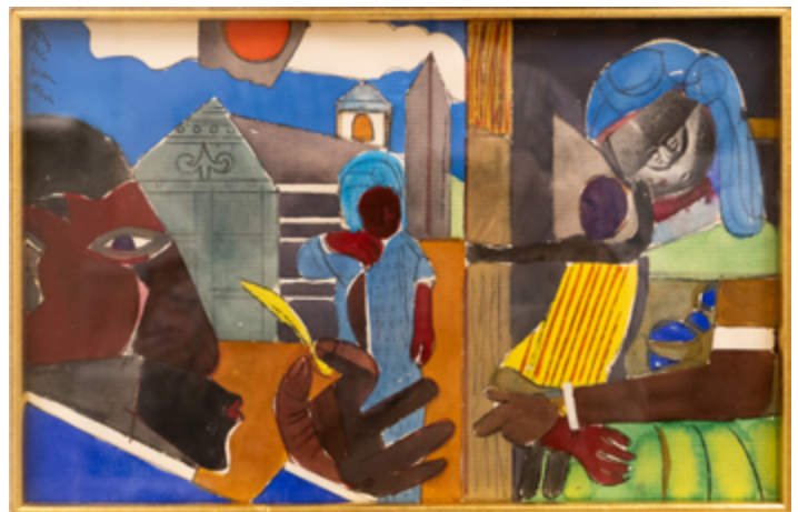
Romare Bearden, Study for Earth Mother, 1978 collage and watercolor on board