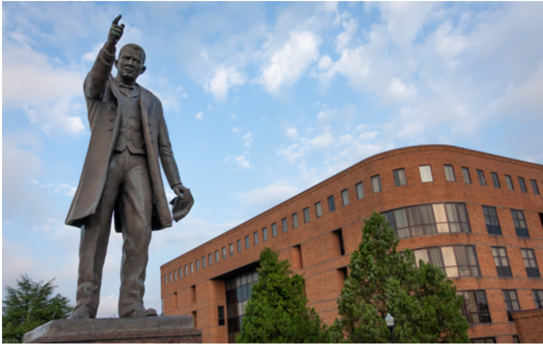
Booker T. Washington gestures toward the Emancipation Oak with the William R. and Norma B. Harvey Library in the background on the Hampton University campus.