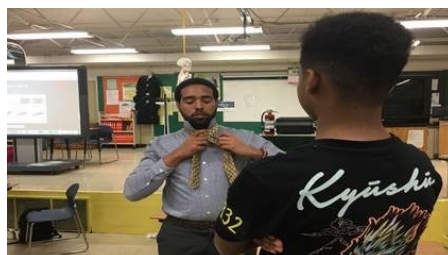
A hands on demonstration of how to tie a tie.