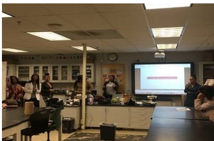
The Women with Doctorate Degrees.

The Women with Doctorate Degrees is a student organization that promotes higher education for young women. They recently went to Bethel High School in order to present "The Social Butterfly: Branding and Image of Social Media." Their presentation revolved around the idea of creating professional and social personal images. The Women with Doctorate Degrees and the female high school students worked in both large and small groups in order to create the perfect App that would be beneficial for their specific age groups. The activity allowed students to harness their creativity, critical thinking, technical skills, and team work in order to design these Apps. The young women left with the knowledge of what defines a professional social and a personal social images.