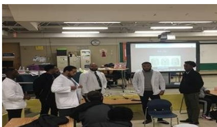
The GIWC beginning their presentation.

Gentlemen in White Coats is a student organization that teaches meaningful career and higher education planning to Norfolk Schools. Recently the Gentlemen in White Coats went to Bethel High School in order to present "Dress for Success." The event included guidelines for what to wear for various events such as interviews, graduation, and formal presentations. The young men received hands on demonstrations that showed the appropriate way to tie a tie or bowtie. The students then practiced tying their own respective ties or bowties. Students gained confidence in their appearance and to acquire skills that will benefit them as they progress further in life.